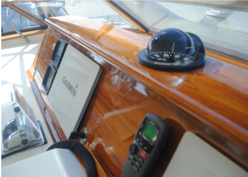
MV KOKOMO – NEW FLYBRIDGE DASHBOARD 2015 – IN AWLWOOD BY RAINBOW MARINE